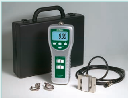
Complete with tension and compression adaptors, six AA 1.5V batteries, and case