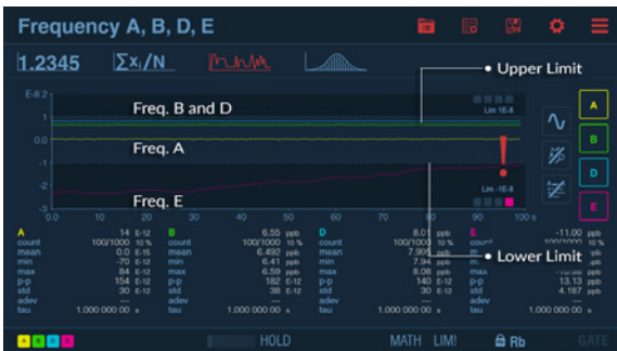
The time-line view reveals drift during the calibration

In the example below, three 10 MHz and one 5 MHz oscillators are tested in parallel, with tolerance limit \pm 0.1 Hz or 1 \times 10^{-8} . Oscillator A, B, D are inside limit range. Oscillator E is just outside range.