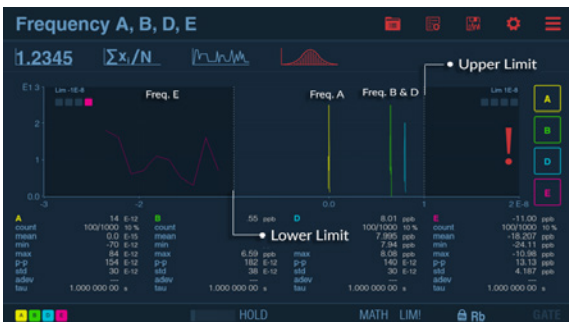
The Frequency distribution view reveals the spread (stability) of the oscillators

The limits can also be viewed in the frequency distribution display mode. The basic information is the same but this graph gives additional info.