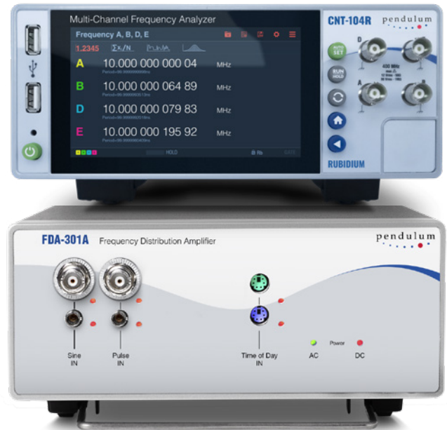
The FDA-301A distribution amplifier extends the number of 10 MHz outputs, up to 12

The CNT-104R comes as standard with one 10MHz reference output with ultimate frequency accuracy to 1 \times 10^{-12} , 24h average, using the optional integrated GNSS disciplining of the Rubidium clock. The addition of an FDA-301A Frequency Distribution Amplifier multiplies the number of outputs that can be distributed to 4, 8, or 12, depending on the number of rear-panel installed output modules (1, 2, or 3).