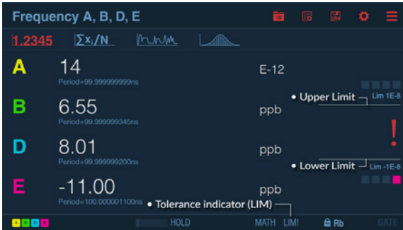
View 4 signals simultaneously on screen. 4 instruments in one!

Measured values are presented as both numerics and graphics. Graphical presentation of results (distribution, trends etc.) gives a better understanding of the nature of jitter. It also provides a much better view of changes vs time, e.g. drift. The same data set can be viewed in Numerical, Statistics, Distribution and Time-line views. It is very easy to capture and toggle between views of the same data set.