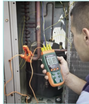
Simultaneously measures 4 temperature inputs for multiple source monitoring