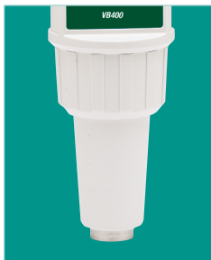
Magnetic base included