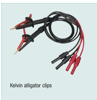
Kelvin alligator clips