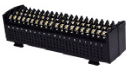
Withstand high-voltage / High-precision terminal B-565