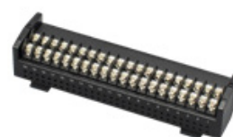
20CH screw input terminal B-563