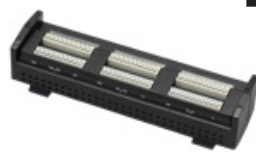
30CH screw less input terminal B-563SL-30