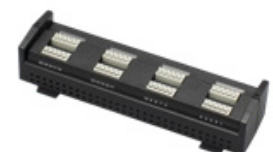
20CH screw less input terminal B-563SL

*Terminals are not included. Please purchase separately.